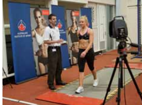
AIS & Berlei Test Lab