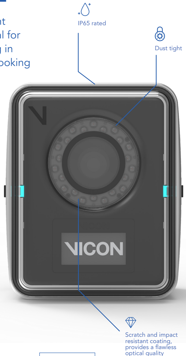
CAPSULE CAMERA ENCLOSURE

It enables you to react to changing capture needs within complex projects, without having to stop to set up the system. With Capsule, the Vicon system is ready when you are.